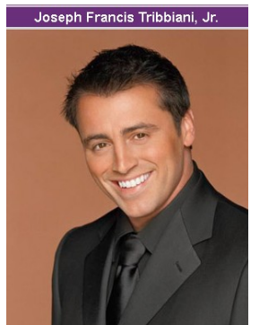
Joseph Francis Tribbiani, Jr.