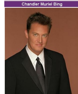
Chandler Muriel Bing