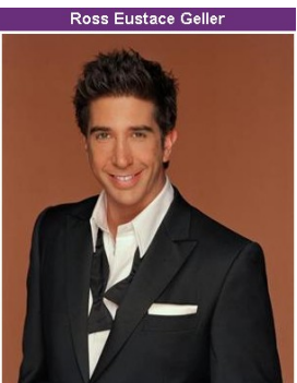
Ross Eustace Geller